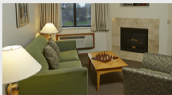
Timber Ridge Lodge