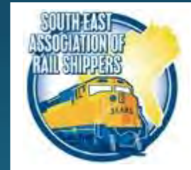
Southeast Association of Rail Shippers