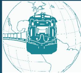
Pacific Northwest Association of Rail Shippers