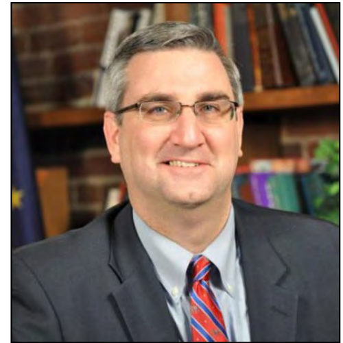
Indiana Governor Eric Holcomb